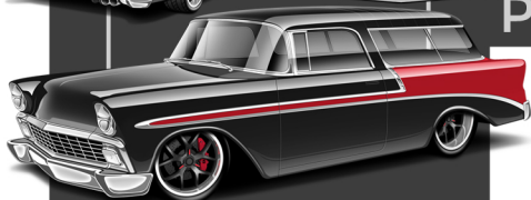
Three views: $2,685