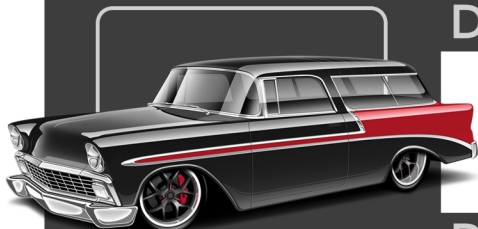
Single view: $895

A $250 deposit is required for all rendering projects. Payment can be made via credit card or check, whichever is convenient for you.